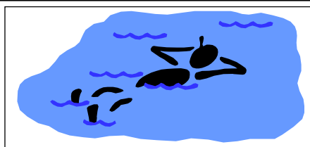
Not much of this going on at the pool during practice! The kids are working hard!

Check the bulletin board and please sign up to help our concession co-chairs with items that they need for the meet. Thanks!