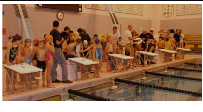
Swimmers prepare for the first heats of the intrasquad meet on October 15.

The yellow group is currently working on the refinement of their strokes. While working on strokes, we are also refining turns. Turns